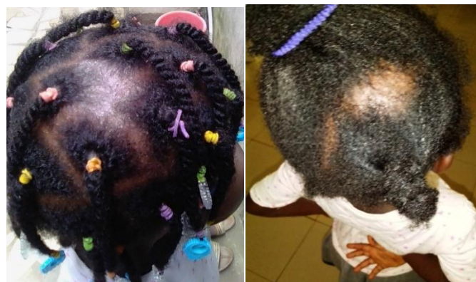
A: Before treatment