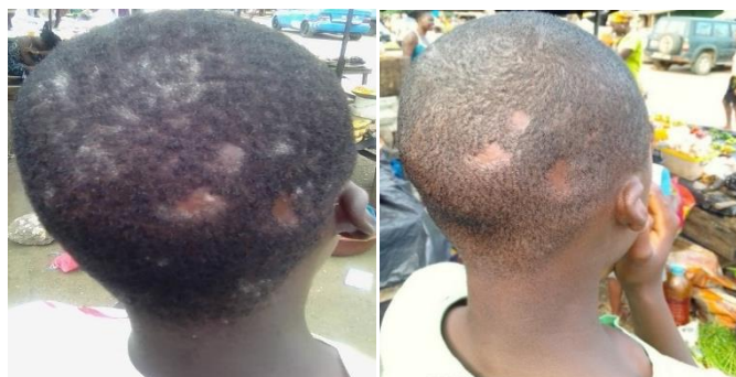
C: Before treatment