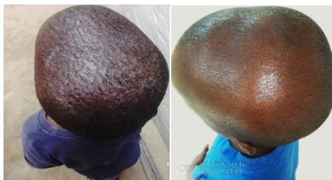
B: Before treatment