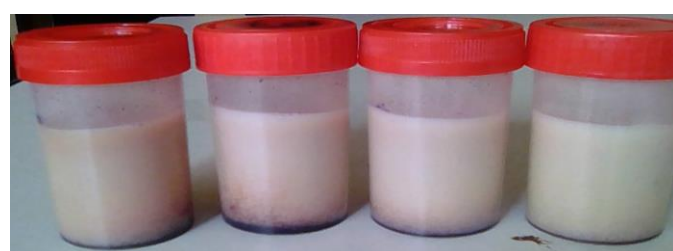
b) C9: 0.0225 g/mL C10: 0.025 g/mL C7: 0.02 g/mL C8: 0.0175 g/mL